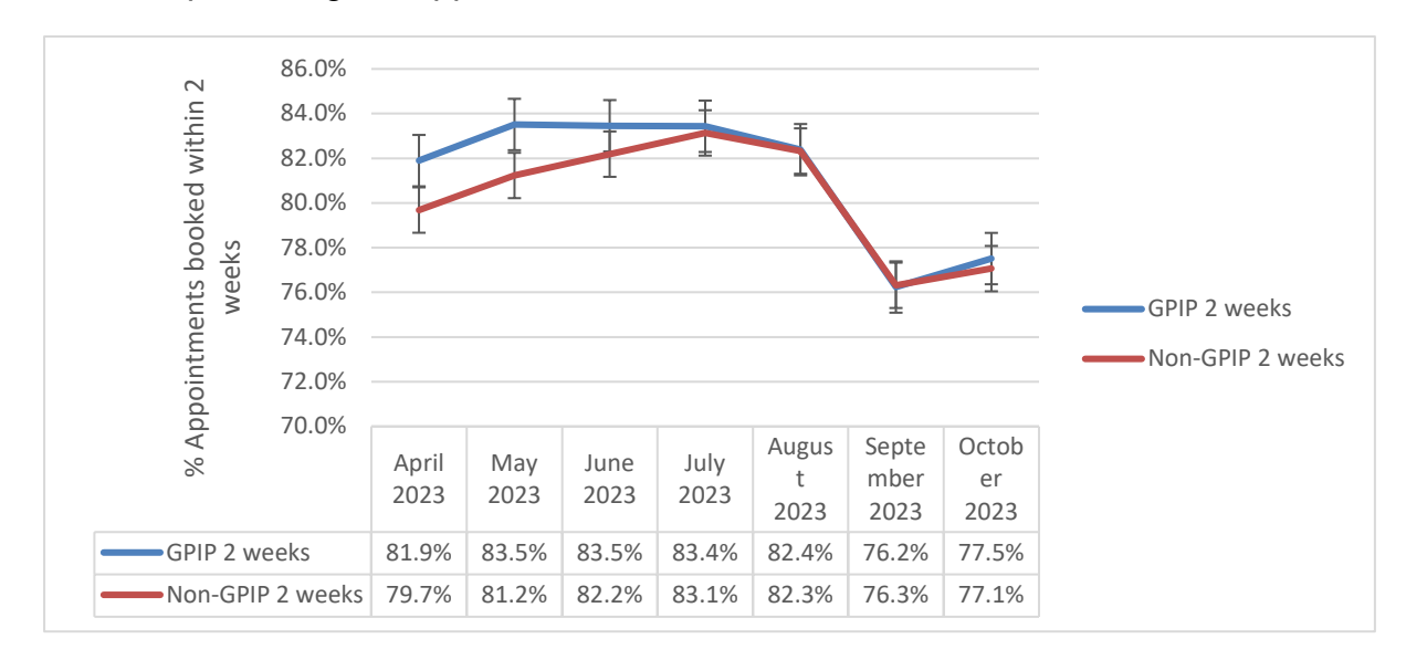
Figure 2: % Appointments booked within 14 days

6.2. The single Phase A practice (which could be expected to have undertaken additional transformation) follows a similar trajectory. This data doesn't include online consultation data. Similarly there is not a significant difference between the percentage of appointments booked within 2 weeks: