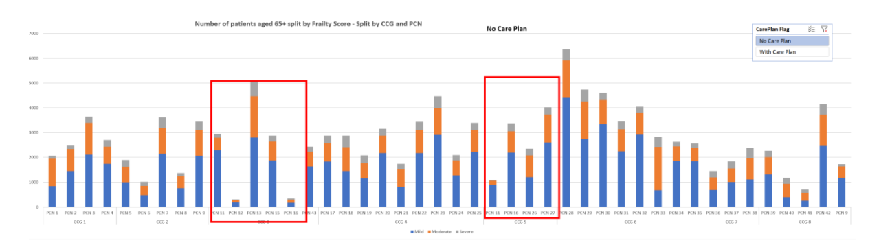
Chart 1: Number of frail patients aged 65+ without a care plan (shown by PCN) – Feb 2023