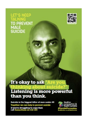
Male suicide poster phase 5 - 1.pdf (healthierlsc.co.uk)

The images below are for illustrative purposes only. Please use the links below the images to download the high-resolution files.