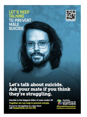
Male suicide poster phase 5 - 3.pdf (healthierlsc.co.uk)