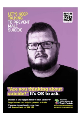
Male suicide poster phase 5 - 2.pdf (healthierlsc.co.uk)